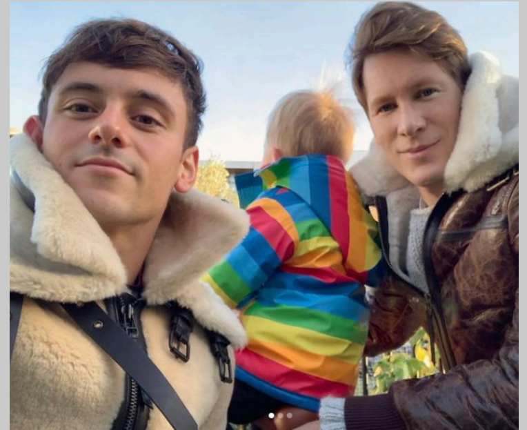
Tom Daley and Dustin Lance Black

The Human Rights Campaign is the premier LGBTQ advocacy group. It is the largest LGBTQ political lobbying organization in the US.